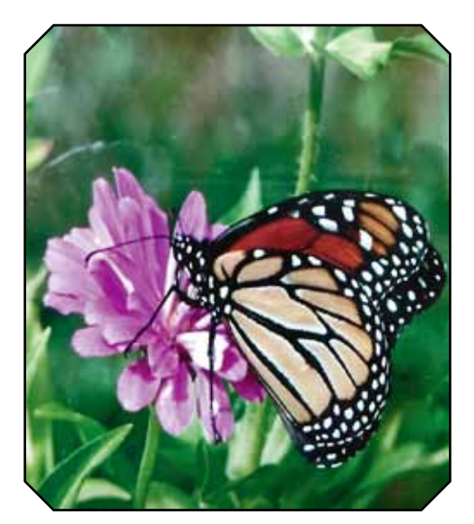
Hatched butterfly drying wings