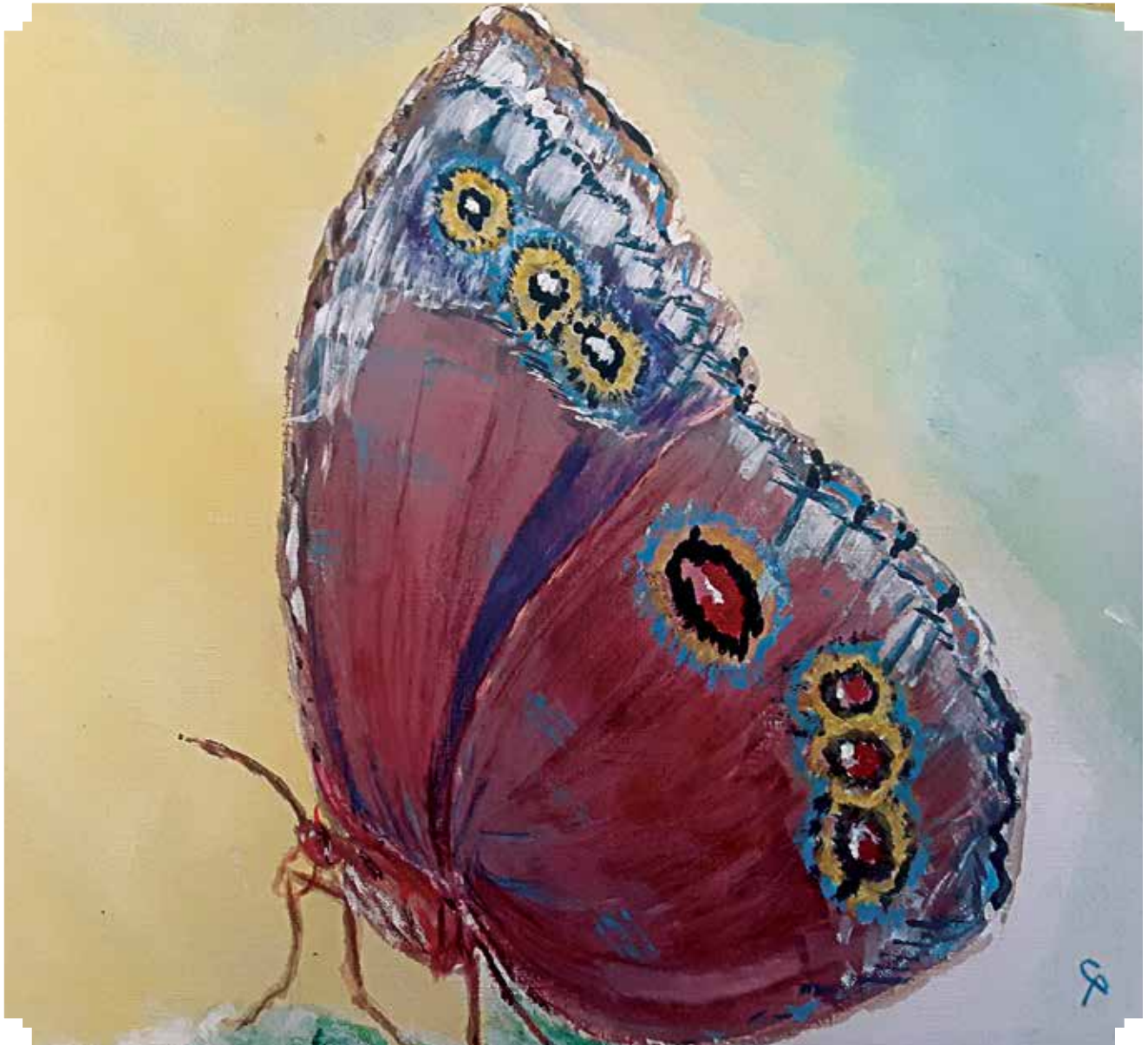
“Red Spotted Purple Butterfly” by Carol Powell LHS Acrylics Class